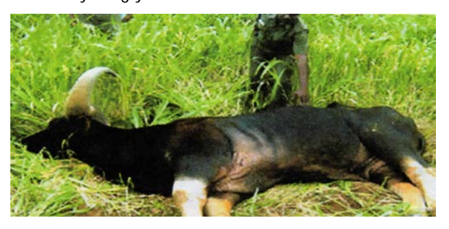
Indian Bison dead of dehydration. 30 September 2009.

Starvation is responsible for the deaths of billions of animals annually. Unlike a predatory attack which can lead to a violent but quick death, death by starvation can drag on for months. During the winter, food is hard to come by. Edible vegetation is often nonexistent or buried beneath snow packs. Many young, weak, and sickly animals cannot endure the lack of food and starve to death. A Michigan Department of Natural Resources study noted, "the number of species diagnosed at the laboratory as dying from malnutrition and starvation are second only to those dying of traumatic injuries." When food is so scarce that billions starve, those that do survive are often chronically hungry and malnourished.