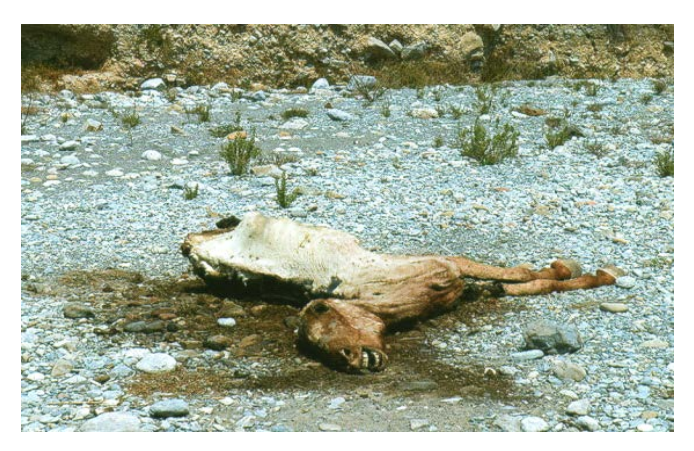
Salmonellosis. Michigan Department of Natural Resources and the Environment. 8 July 2010.

Those dying from dehydration are indicative of a far greater amount of misery. Consider being confined to a room with 9 other people where little or no liquid is available. All must remain in the room until one person dehydrates to death. Though only one of the ten dies, most in the room are likely to be suffering due to the lack of water.