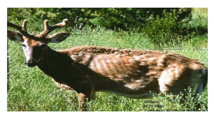
An emaciated deer with ribcage visible. Deer that are emaciated during the summer, a time when food is more readily available, will usually succumb to starvation during the food-scarce winter months. Miller, M. Colorado Division of Wildlife.