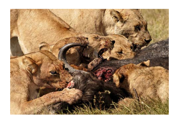
Why animal activists should reconsider their environmental ethics.