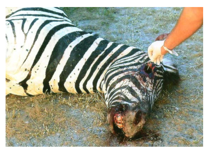
Zebra killed by Bacillus Anthracis Infection. 3 May 2010. Elainwe. Etosha National Park, Namibia.

Parasitologists speak of ectoparasitism when the uninvited guest lives on the surface of its host, and endoparasitism when the parasite dwells within. Among endoparasitic ichneumons, adult females pierce the host with their ovipositor and deposit eggs within. Usually, the host is not otherwise inconvenienced for the moment, at least until the eggs hatch and the ichneumon larvae begin their grim work of interior excavation.